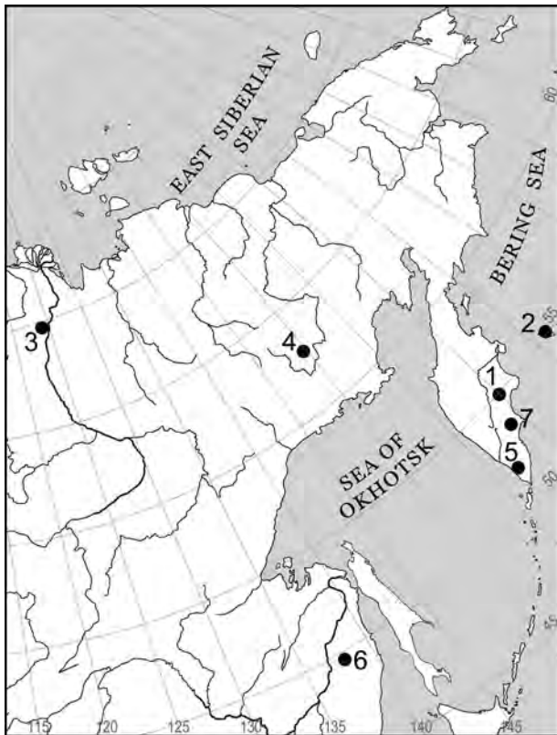
Figure 1 Locations of Deschampsia specimens sampled

glume 4.5–5.5 (7) mm. Lemmas (of lowest floret) 3.2–4.5 mm, awn exerted from the lower 1/3 of the lemma and usually does not exceed the lemma apex. Callus hairs equal to 1/4–1/5 of lemma length. Anthers 1.5–2.2 mm. Chromosome number: 2n = 42 .