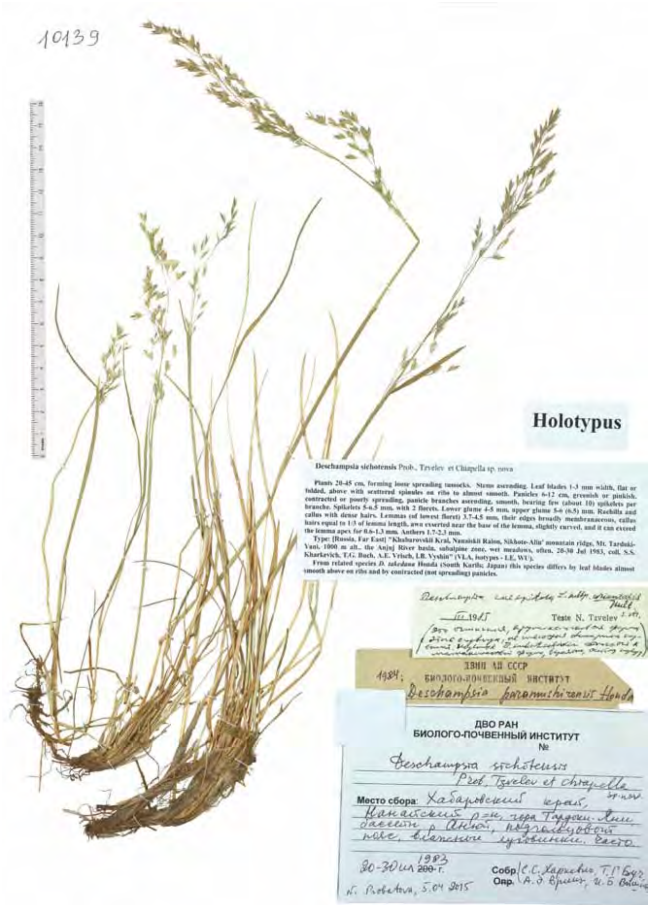
Figure 4 Holotype specimen of Deschampsia sichotensis sampled in Khabarovskii Krai, Nanaiskii Raion, Sikhote-Alin' mountain ridge, Mt. Tardoki-Yani, 1000 m alt., the Anjui River basin, subalpine zone, wet meadows, often, 20-30 Jul 1983, coll. S.S. Kharkevich, T.G. Buch, A.E. Vrisch and I.B. Vyshin.